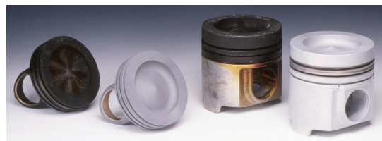
Before & After