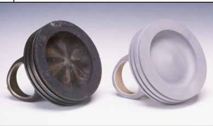
Before and after soda blasting tells a compelling story – but be aware that that story isn’t necessarily the same for every engine builder. Your needs may vary.

Today, we have progressed to pneumatic vibrator cleaning cycles, automatic-timed reverse pulse cleaning that cleans during machine