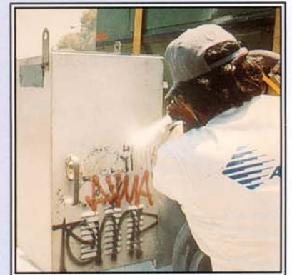
Graffiti removed from a traffic control box in Los Angeles