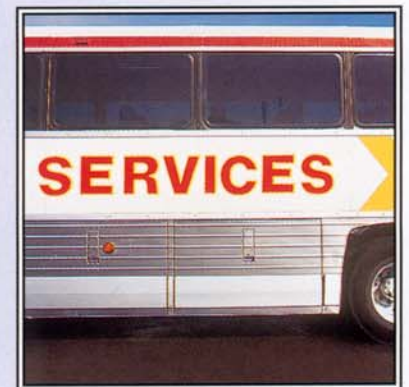
Graffiti removed from a bus in San Antonio without any damage to underlying paint